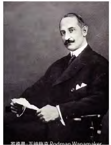
罗德曼·瓦纳梅克 Rodman Wanamaker