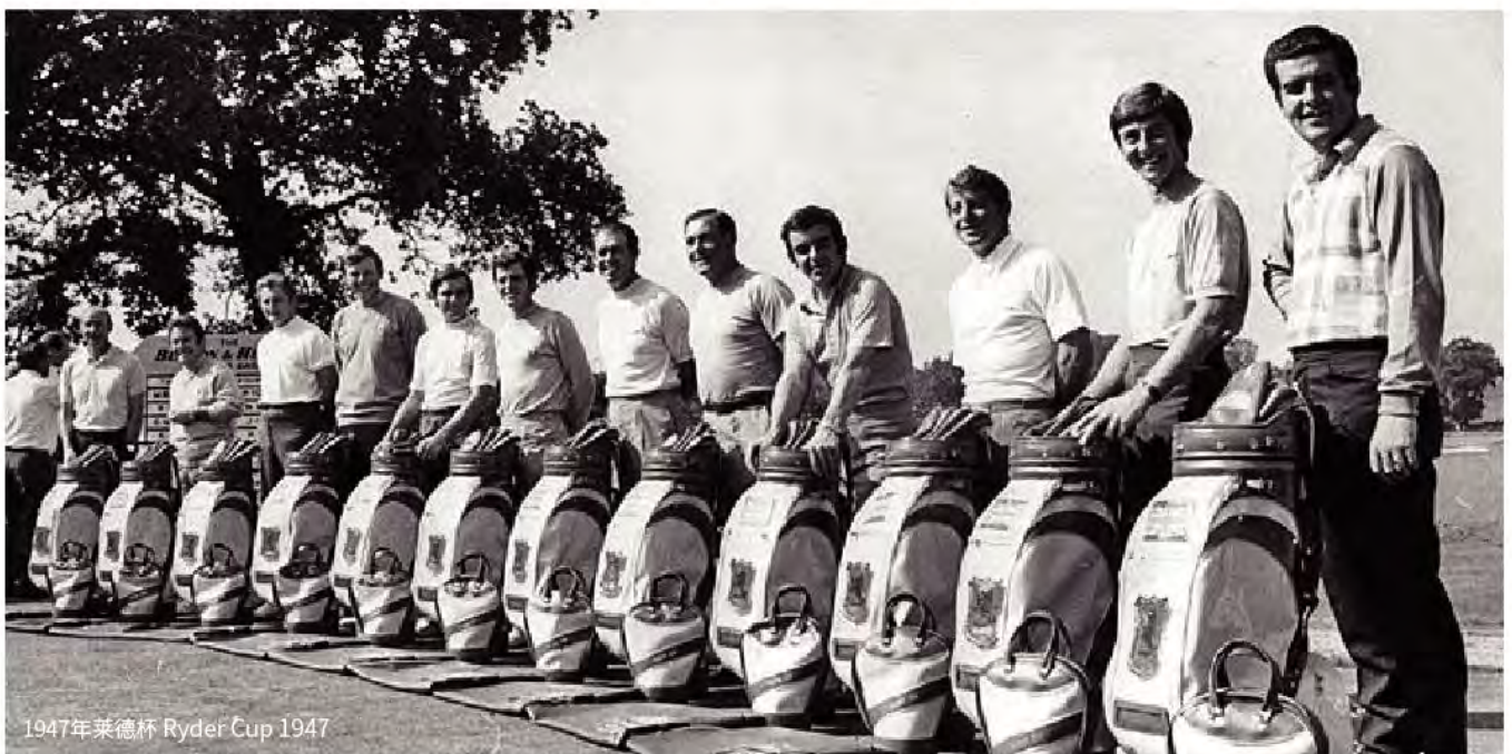
1947年莱德杯 Ryder Cup 1947

Manages four of golf's biggest events in the Ryder Cup, PGA Championship, KitchenAid Senior PGA Championship, and KPMG Women's PGA Championship, also the Junior PGA Championship, the world's largest golf PGA expo and golf learning and performance centers